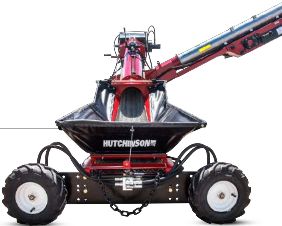
HCX 1590 SWINGAWAY HOPPER